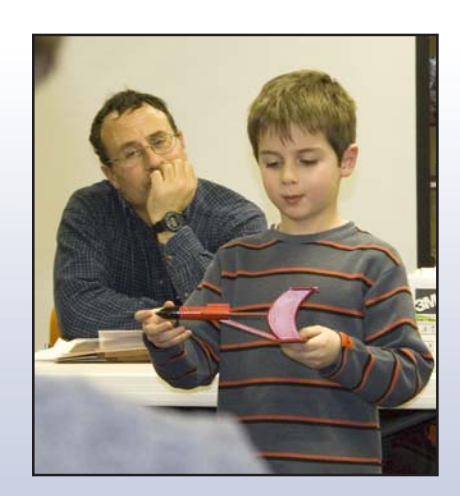
There are always lots of interesting rockets at NIRA's monthly model of the month competitions.