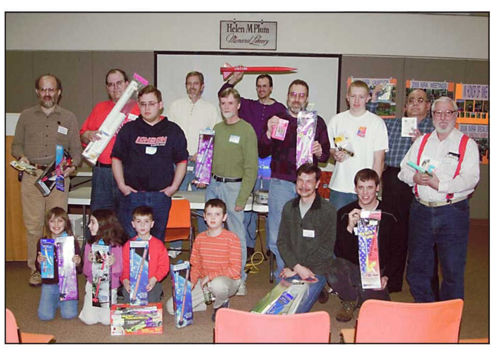
NIRA members display their winnings from the NIRA auction. Members earned NIRA-bucks throughout the year for their participation in club activities.

This year's NIRAcon was bigger than ever. We had the use of the full conference room in the basement of the Helen Plum Library in Lombard. NIRA members provided lots of drinks and snacks that came in handy as the conference went way past noon.